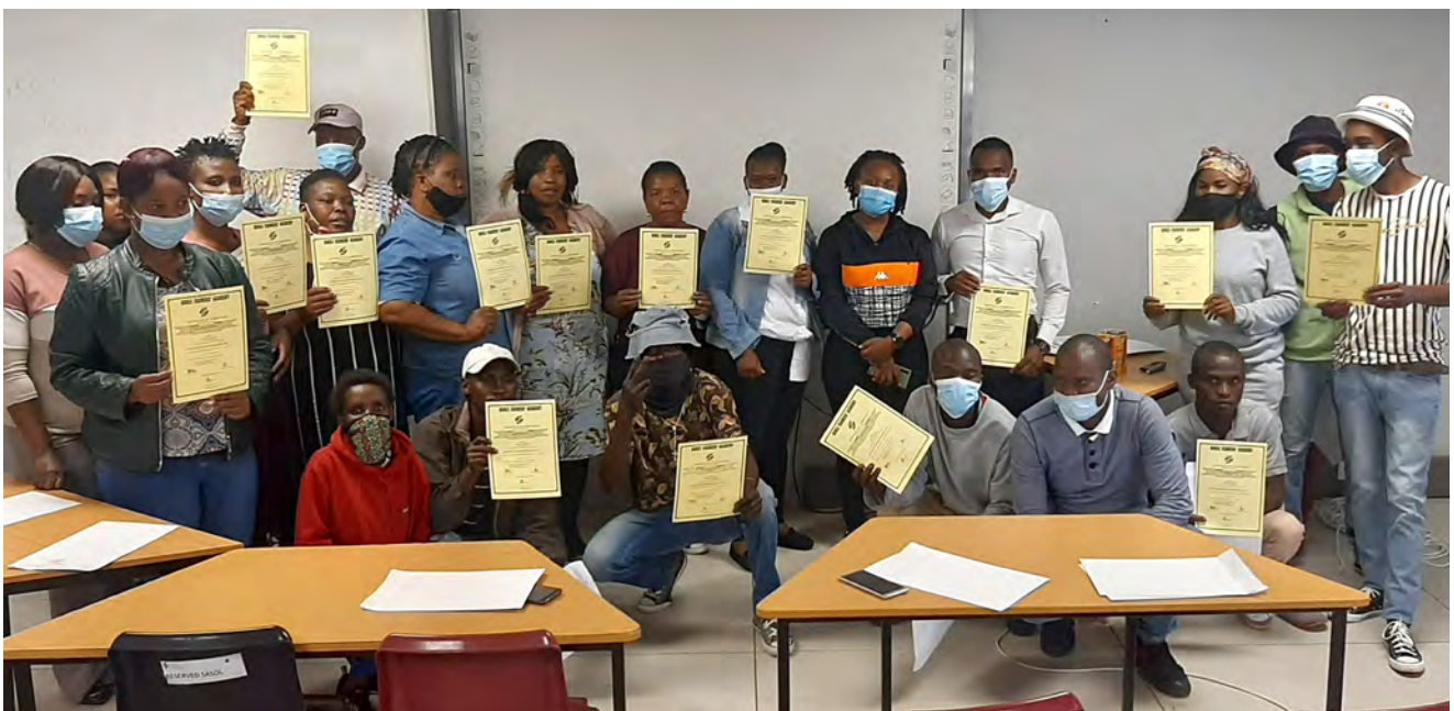
Buhle Graduation Class of 2021

To date, Kids Haven has used funding from BASF HOLDINGS SA to identify and secure suitable training for the Garden Champions. The Champions have a support role to help at least 25 other homebased gardeners in their area. They give advice, visit, and share information and provide feedback to Kids Haven. Kids Haven relies on the Garden Champions to support the needs of their neighbours so that the Organization can supply seeds, garden implements and any other item that the gardeners may specify. This system of collaboration is successful, and the Garden Champions enjoy their roles as identified leaders in their community and constantly meeting with their neighbours and growers in their care.