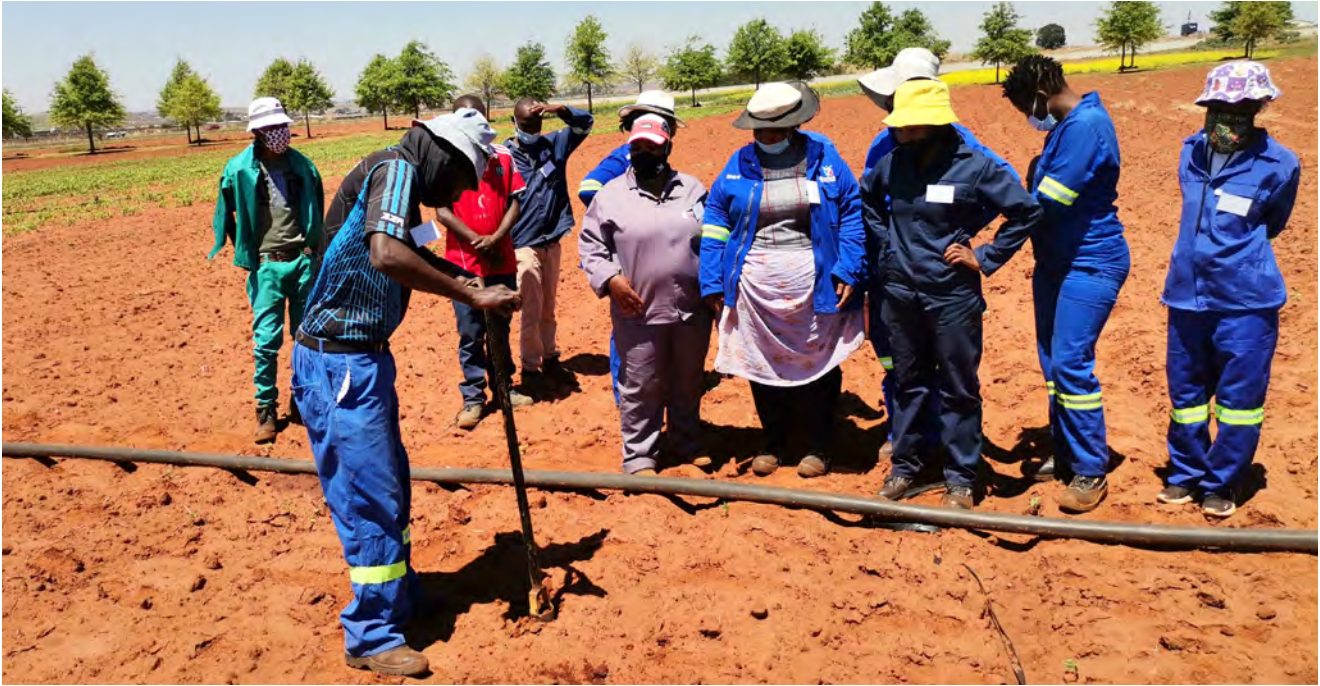
Trainees learning planting technique